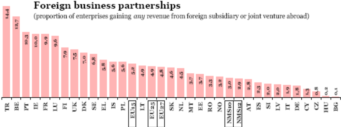
Graph A2. Foreign business partnerships

Q37. How much of your total turnover, that is your annual sales in percentages is created in foreign subsidiaries, joint ventures abroad?