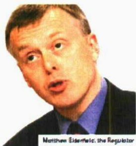
Matthew Elderfield: the Regulator

In fact Pillage has evidence that a failure of liquidity, that if it – as may well have been the case – was typical to both Irish banks and foreign-owned subsidiaries, shows dysfunctionality on a scale that should have prompted the financial regulator to advise the government to go out into the markets and get funds for the banks immediately, was ignored by the regulator. Nor did auditors pick up on it. Indeed it is highly likely