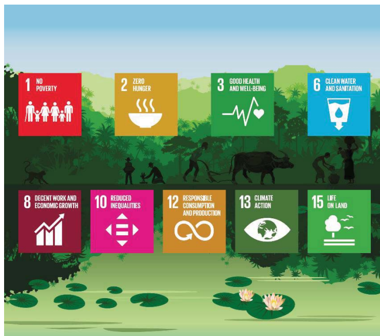
Figure 1 - Forest goods and services supporting the UN Sustainable Development Goals

Further EU measures to protect forests would be consistent with international agreements and commitments, which fully acknowledge the need for ambitious action to reverse the trend of deforestation. The Paris Agreement on Climate Change and the Global Strategic Plan for Biodiversity 2011-2020 adopted under the UN Convention on Biological Diversity and the Aichi Biodiversity Targets promote sustainable forest management, protection and restoration efforts 14 . Reducing forest loss and degradation is a priority under the UN Strategic Plan on Forests 15 . Strengthening efforts to manage forests sustainably is also central to the UN 2030 Agenda for Sustainable Development as forests play a multifunctional role that supports the achievement of most Sustainable Development Goals.