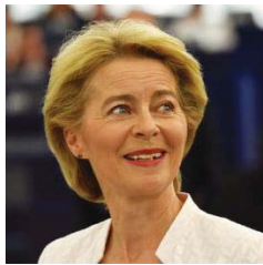
Ursula von der Leyen

The joint European Roadmap towards lifting COVID-19 containment measures, presented by the President of the European Commission and the President of the European Council, responds to the European Council Members' call for an exit strategy that is coordinated with Member States and that will prepare the ground for a comprehensive recovery plan and unprecedented investment.